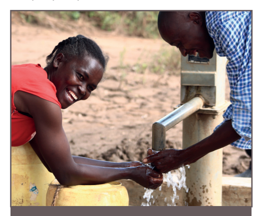
Investing in our future

Four dryland communities supported by Excellent (and your donations) share their unique perspectives on how sand dams and clean water have transformed their lives.